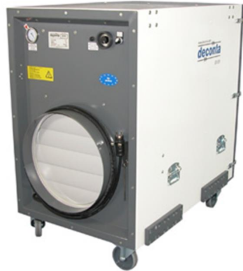
Typical tools for isolation